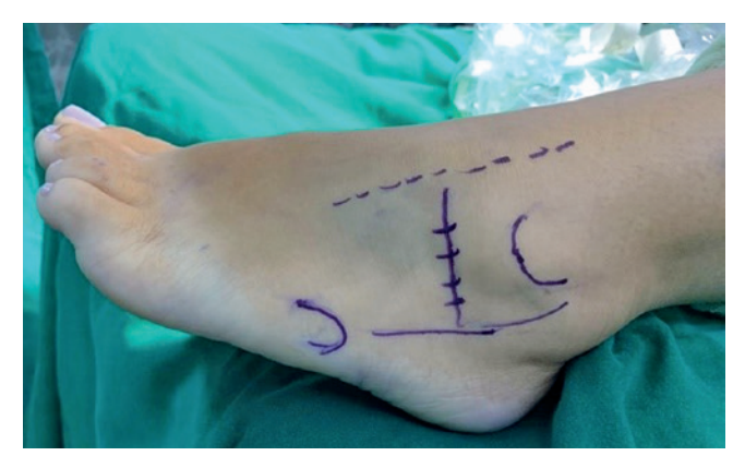
Figure 1. Safety zone marked out on the anterolateral aspect of the ankle

Exploration of the lateral groove, with debridement of the anterior inferior tibiofibular ligament (AITL, Bassett's ligament). We use this ligament as an anatomic landmark to locate the "footprint" of the ATFL on the fibula. We attempt to identify and obtain a good view of the ATFL, to preserve it during exposure of the anterior margin of the fibula.