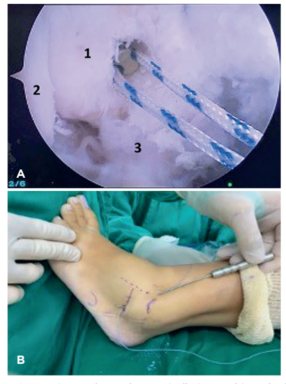
Figure 2. (A) First anchor arthroscopically inserted into the lateral malleolus (1) Distal fibula (2) Lateral wall of the talus (3) Anterior talofibular ligament. (B) Sutures passed percutaneously

With regard to complications, two patients (12.5%) exhibited neurapraxia of the superficial peroneal nerve. After drug-based clinical treatment, one patient had full resolution of the condition while the other only achieved partial recovery. There were no cases of infection or of recurrence of instability.