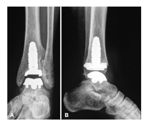
Figure 4. Radiographs six weeks after TAA surgery (Inbone II<sup>®</sup>). A. AP non-weight-bearing ankle radiography showing good implant alignment and positioning, in addition to the free spaces in the medial and lateral gutters. B. Lateral ankle radiograph with good implant alignment and positioning.

In the postoperative period, most authors recommend immobilization of the limb for six weeks, with the main purpose of protecting soft tissues and achieving implant-bone integration. Walking can be encouraged with the use of two crutches with partial weight-bearing on the operated limb, and with the use of a walking boot. After the stitches are removed, which should occur after approximately three weeks, some degree of assisted passive mobility should be initiated. Antithrombotic agents are administered during the immobilization period<sup>(13)</sup>. Once the first six weeks have elapsed, the patient undergoes a clinical and radiological examination (Figure 4). Depending on the patient's progress, a more intense physiotherapy program is instituted for the following purposes: encouraging the patient to walk, gradual increase in weight-bearing, proprioception exercises, gain in active