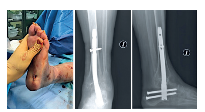
Figure 2. Immediate postoperative result.