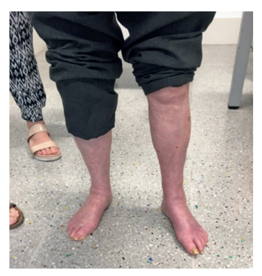
Figure 4. Good outcome at 3 months.