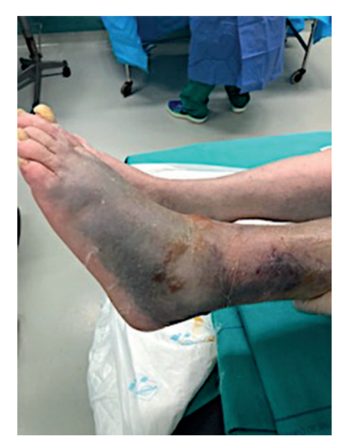
Figure 1. Patient in position. Note the poor condition of soft tissues.

At 48 hours after admission, the wound was checked and the patient was discharged if there were no complications. Full weight bearing was allowed as tolerated and protected by the use of a CAM walker boot for 6 weeks. The stitches were removed after 3 weeks.