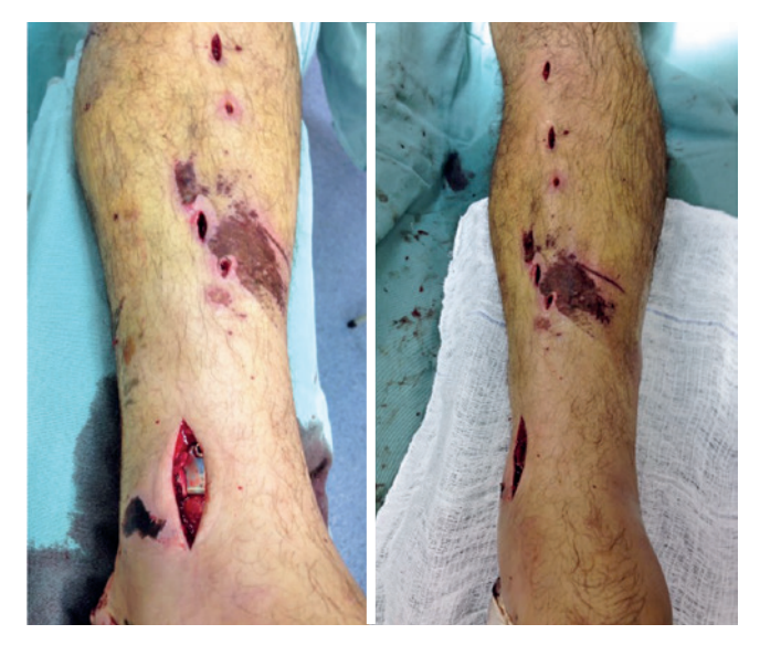
Figure 2. Intraoperative appearance, showing the distal incision and three proximal incisions.

The plate performs both bridging and reduction roles. As the first 4.5-mm cortical screw is driven proximal to the fracture site, the fracture is reduced by an implant interference mechanism. At this stage, image intensification is used to analyze the reduction and the two distalmost cancellous screws are then driven (also under fluoroscopic guidance). The fourth screw is placed into cortical bone in the most proximal hole; the fifth and sixth screws to be placed are cortical and cancellous respectively. Judicious intraoperative control is essential so that the screws placed in the distal fragment do not pierce the distal tibiofibular joint (Figure 3).