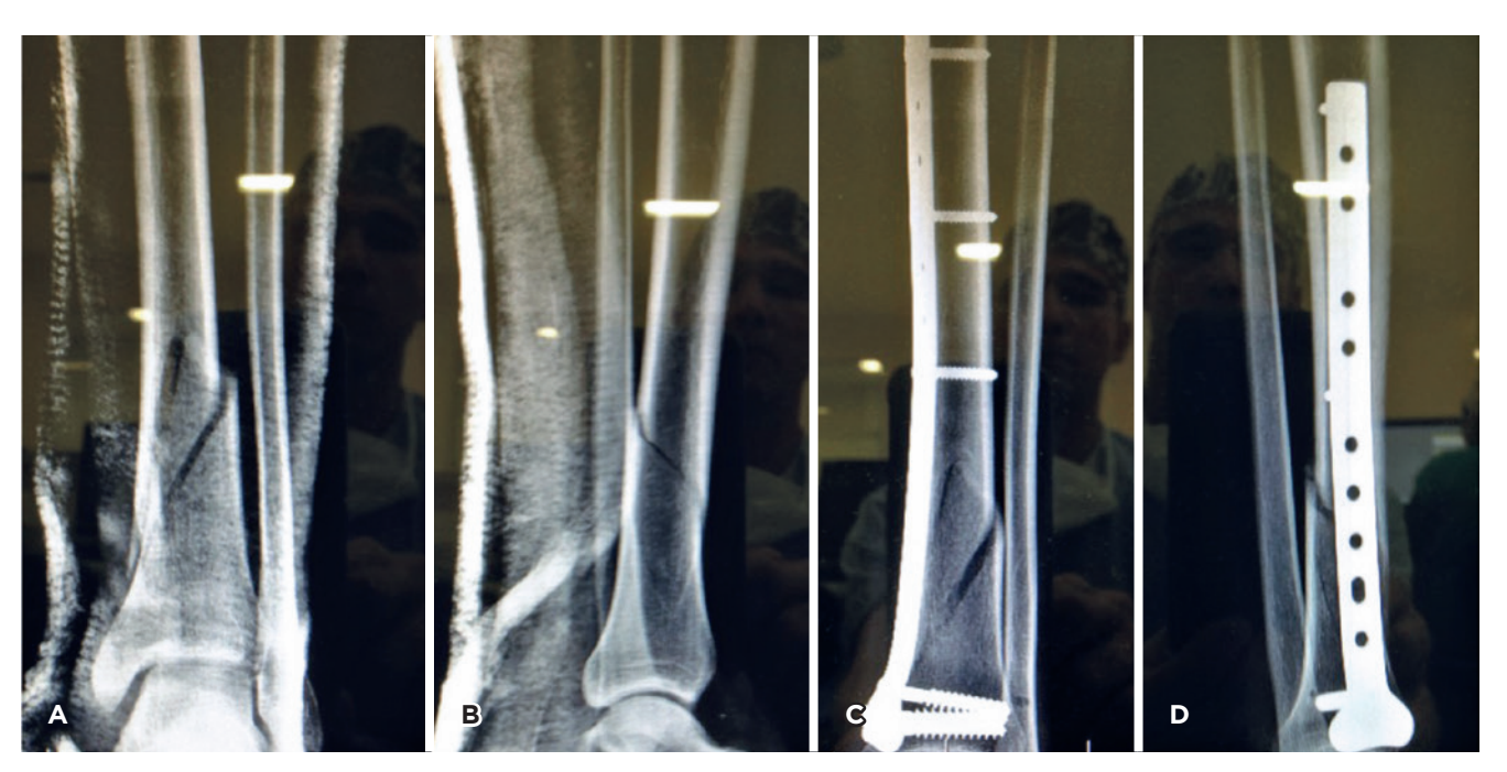
Figure 3. A and B: extra-articular fracture of the distal tibia; C and D: appearance of the fracture after placement of a T-plate inserted in retrograde, ascending fashion. Note location and arrangement of screws in the distal segment.

The surgery is performed with the patient under locoregional anesthesia, in the supine position, with both lower limbs prepared, thus allowing intraoperative comparison of length, rotation, and angulation. In the immediate postoperative period, active and early mobilization (including ambulation with the aid of crutches) were encouraged. Discharge was scheduled for 24h after surgery, except in cases of compound fractures, which had a longer hospital stay.