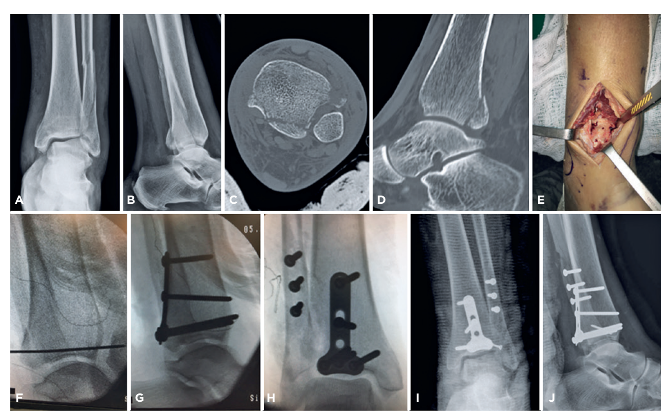
Figure 1. Posterior malleolus fracture (A to D). Posterolateral access with structures reflected for visualization of the posterior malleolus (E); internal fixation of the posterior malleolus and fibula through the posterolateral approach (F to J).