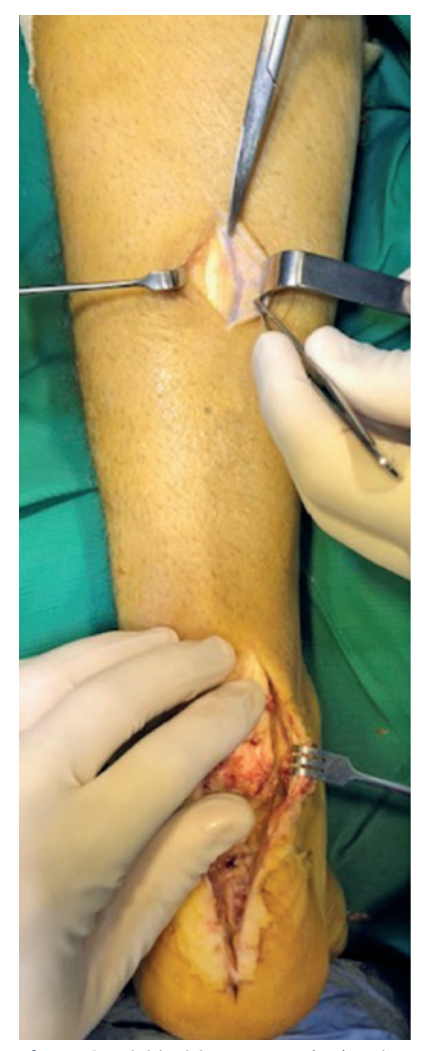
Figure 2. Mini-incision approach showing fascia with inverted V incision.