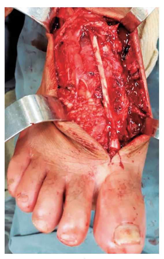
Figure 5. Intraoperative image of post-tumor resection, showing the preservation of the extensor retinaculum and EHL.