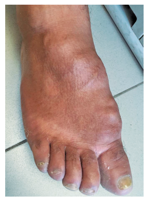
Figure 1. Preoperative image of the right foot showing the tumor mass in the dorsal region.

The patient presented good wound healing (Figure 6) and had no neurofunctional deficit in the foot.