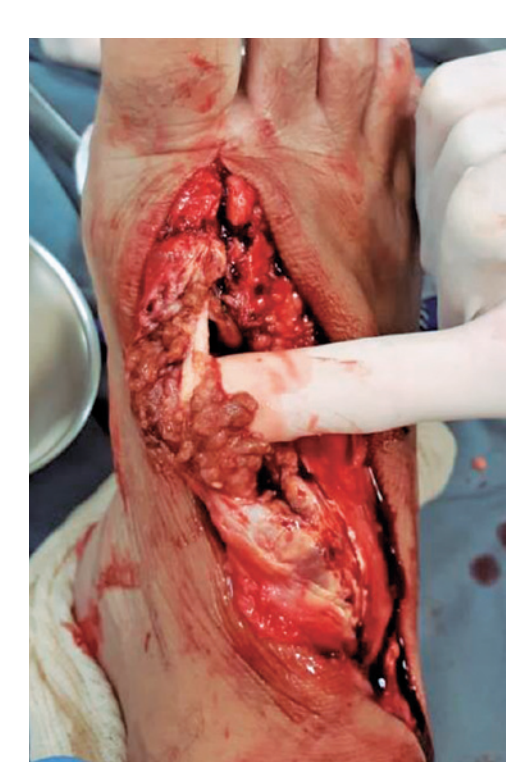
Figure 4. Intraoperative image showing pigmented lobulated lesions involving the EHL, with characteristics of a giant cell tumor of the tendon sheath.