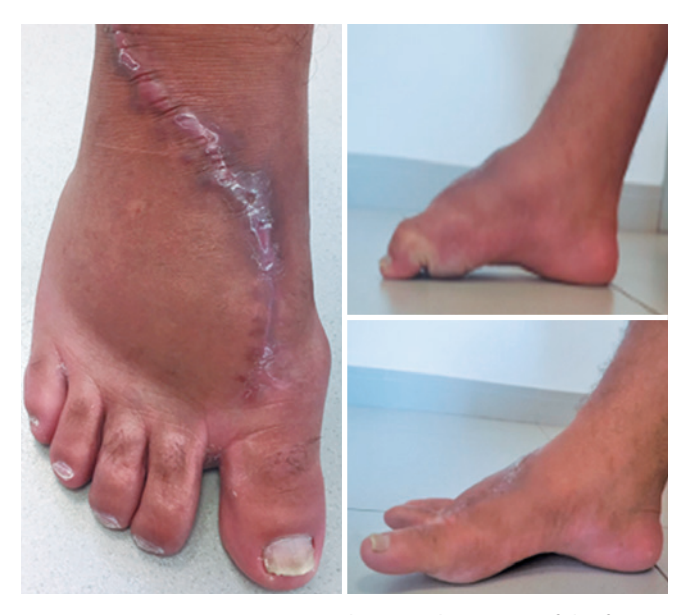
Figure 6. Postoperative images showing the aspect of the foot at 3 months after surgery, with preserved function of the EHL and the flexors of the toes.