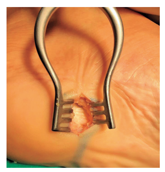
Figure 1. Oblique incision along the midfoot-hindfoot transition.

retractors (Figure 2). After exposure, the superficial fascia of the abductor hallucis was released. The deep fascia of the abductor hallucis was identified and released. Upon the release of the deep fascia, the structures were moved to the side. In the plantar region of the surgical wound, the medial plantar fascia was identified in the inferior aspect of the wound, and then the medial plantar fascia was sectioned with a scalpel or scissors (Figure 3), followed by hemostasis and surgical cleaning. Subsequently, the surgical wound was sutured, and a sterile dressing was applied.