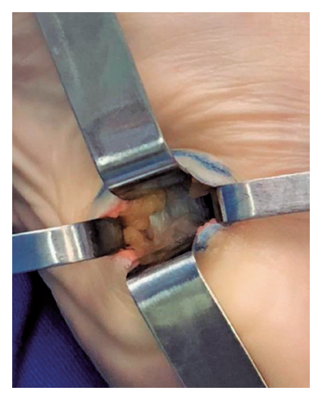
Figure 2. After deep dissection, retraction of the fatty tissue using Farabeuf retractors to identify the superficial fascia of the abductor hallucis.

SPSS 23 for macOS was used for all statistical analyses. The Wilcoxon test, a nonparametric paired-difference test,