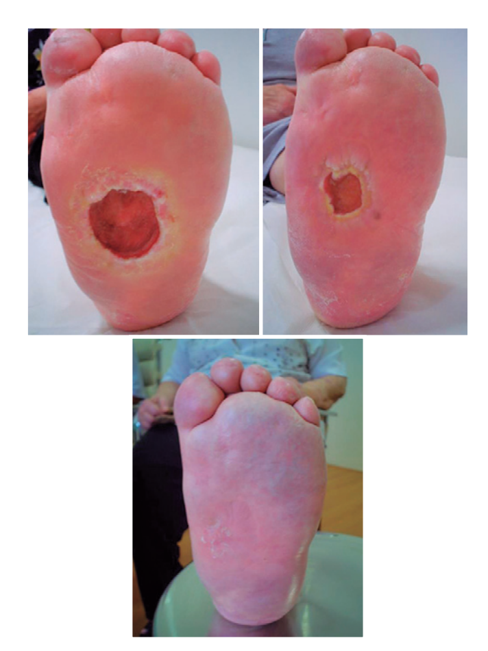
Figure 3. Wagner grade 2 plantar ulcer in the midfoot and its progression until fully healed.

it is the main risk factor for type 2 diabetes. This close relationship led to the portmanteau "diabesity", which highlights the fact that most individuals with diabetes are overweight or obese. To date, BMI has been used to classify overweight and obesity. Because reduced muscle mass is highly prevalent throughout the BMI range, a measurement of body composition is strongly recommended<sup>(12,13)</sup>.