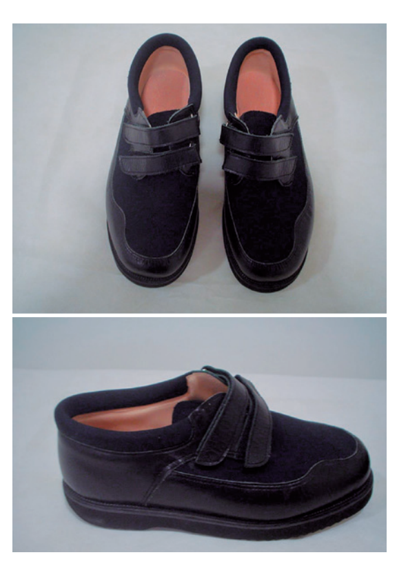
Figure 1. Footwear for insensitive feet.

The studied variables are presented in tables with absolute and relative frequency distributions. The associations were tested using Pearson's chi-square test, and the quantitative variables were tested using Student's t-test, both at