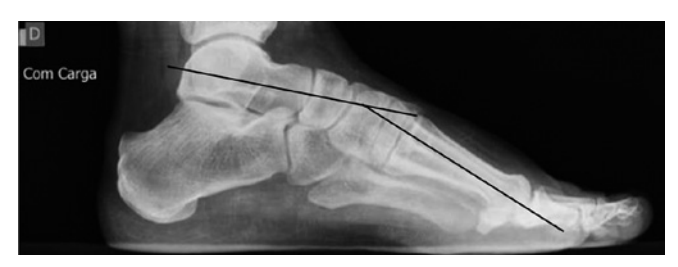
Figure 1. Profile radiograph of the right lower limb showing pes cavus.