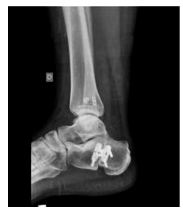
Figure 2. Immediate postoperative profile radiograph of the right lower limb showing lateral sliding osteotomy for pes cavus.